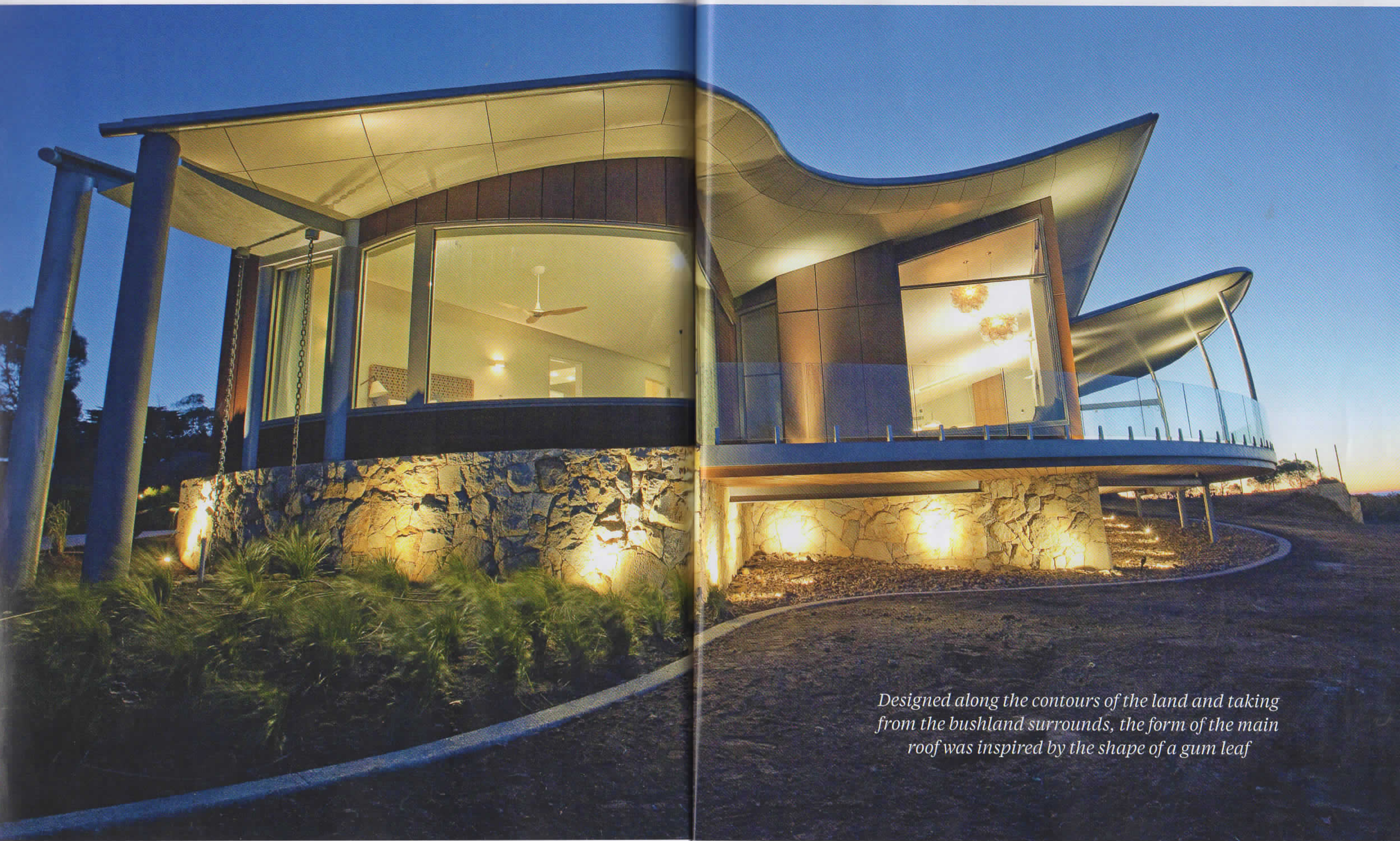
Designed along the contours of the land and taking from the bushland surrounds, the form of the main roof was inspired by the shape of a gum leaf